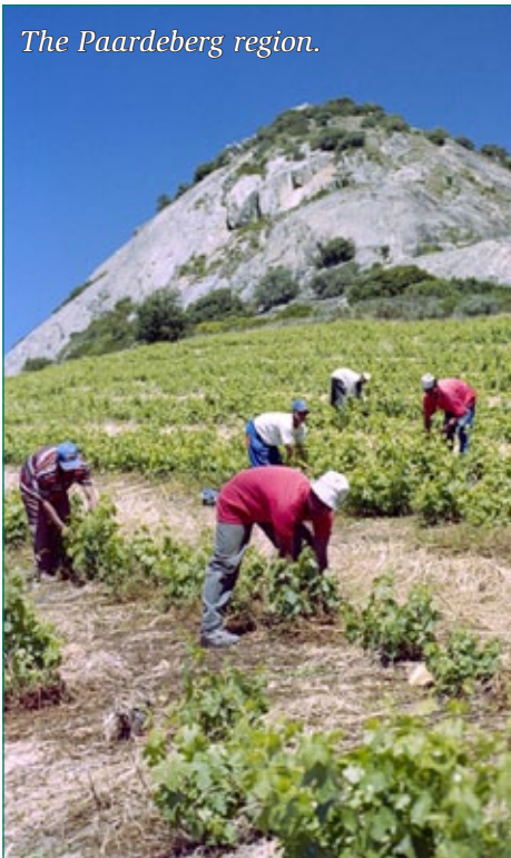
The Paardeberg region.

regions. This hilly, off-the-beaten-path area offers delightful surprises around every bend. The climate during winter is very cold. Summer is typically very hot during the day, with cooler temperatures at night. Some of the highest vineyards above sea level in the Swartland region are found there. Vines are planted on the slopes of the Paardeberg in relatively deep soil consisting of decomposed sandstone, granite and some clay.